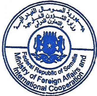
Yusuf - Garaad Omar Minister of Foreign Affairs and International Cooperation

The gains we have won together can be lost without redoubled efforts, and we entreat you to consider our situation with the diligence that it deserves.